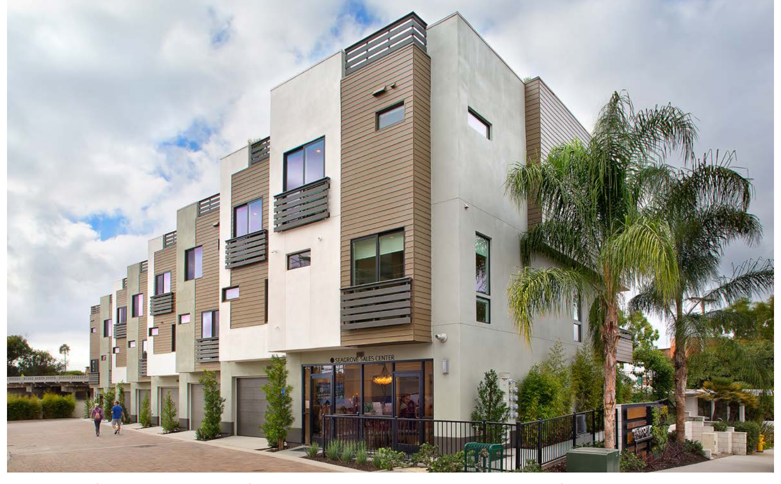
▲ Articulated facades create a sense of movement and energy, in keeping with the spirit of the community and its lively seaside context.

"Homes at Level One, Superior Pointe, and Seagrove appeal to a variety of potential residents who value living close to retail and commercial areas in a community that offers a mix of urban and coastal living in Southern California."